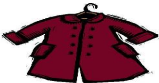
Warm Clothing Drive

We will continue collecting warm clothing (sweaters, jackets, hats, gloves, blankets) through January. Please put clean items in the green & red box in the entryway. Mission on Our Doorstep is helping keep people warm!